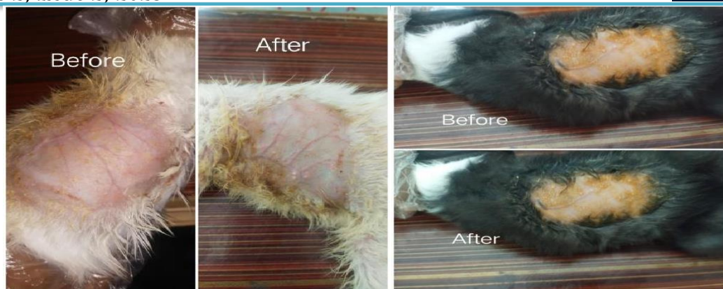
Figure 2. Effect of M. indica flowers extract in different solvents on psoriasis parameters in two weeks